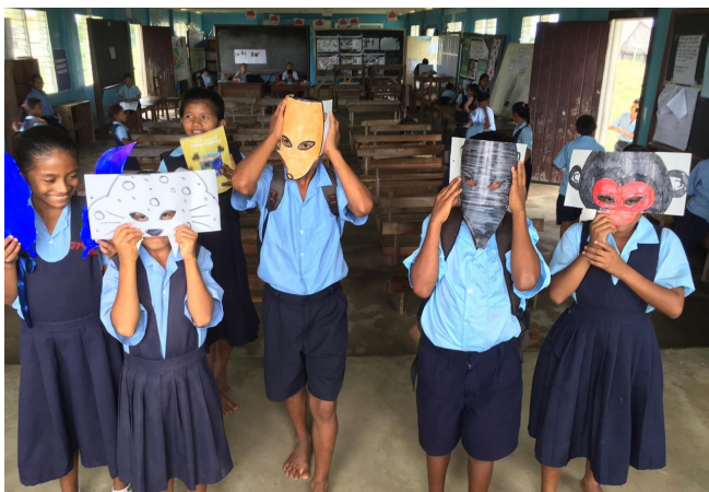
Students from Shea Primary School model their animal masks which they made for their end of Term One exhibition.