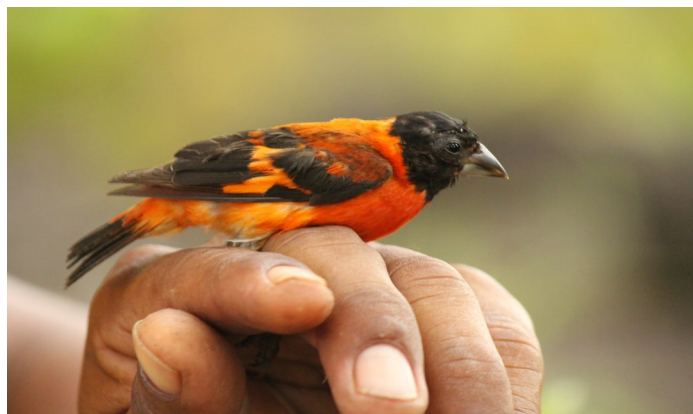
A great picture of a Red Siskin, caught in a mist net by one of our rangers. The bird was measured, banded and recorded before being released.

Are you interested in assisting the teachers with the lessons? Do you have traditional knowledge and skills to share? If so, then please contact one of the teachers (Shea, Macushi and Kumu Primary and Sand Creek Secondary) and let them know.